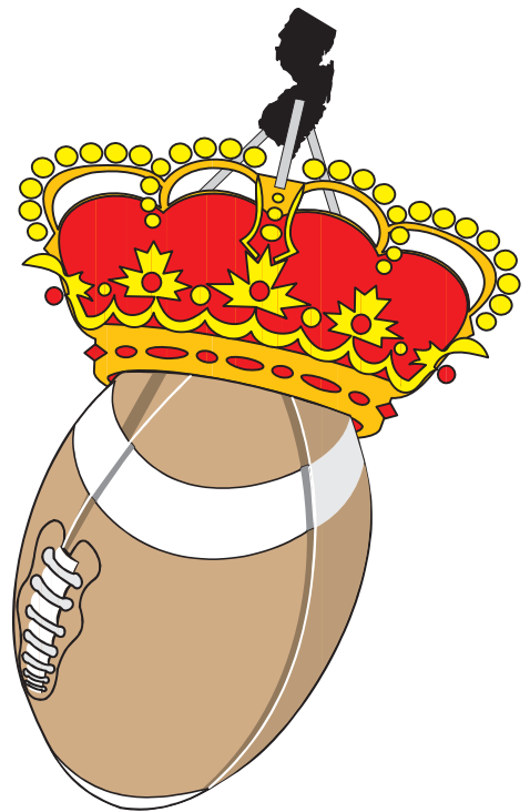
New logo for NJ Kings

71 Farmingdale Drive Parsippany, NJ 07054 (201) 428-8150